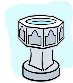
The Sacrament of Baptism

Baptism is the way out of the kingdom of death into life, the gateway to the CHURCH, and the beginning of a lasting, communion with God.